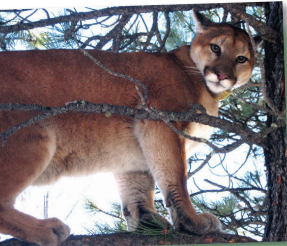
Cougars have a modest lung capacity and are sprinters; dogs, which are distance runners, are used by biologists to run tired cats up trees where they are harmlessly captured for study then released.

Presorted Standard U.S. Postage PAID Pebble Beach, CA Permit No. 5