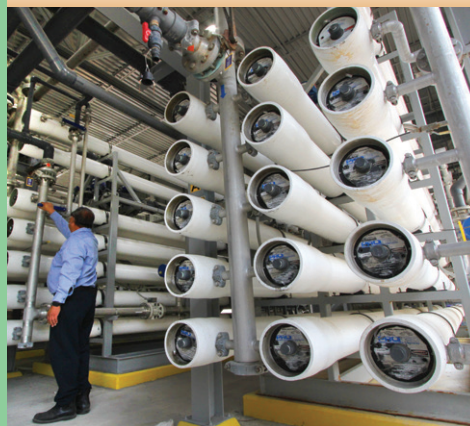
The microfiltration/reverse osmosis system at the CAWD plant transforms treated wastewater into high quality recycled water for golf course irrigation.