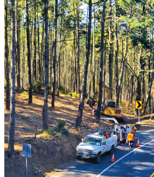
Fuel reduction along Hwy 68 (shown here) and all evacuation routes ensures that fires would be low-intensity and slow-moving near the roadways.

CAL FIRE crews and contractors remove dry vegetation and fallen Monterey pines, and selectively thin overgrown, low habitat value areas to encourage healthy new growth. In addition, each year hundreds of goats are brought in to munch dry vegetation in inaccessible areas. Work is prioritized using sophisticated fuel modeling applications, in cooperation with our partners: CAL FIRE, Del Monte Forest Conservancy, Pebble Beach Company, and the foresters and naturalists on the Open Space Advisory Committee.