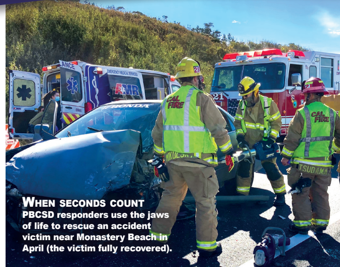
WHEN SECONDS COUNT PBCSD responders use the jaws of life to rescue an accident victim near Monastery Beach in April (the victim fully recovered).

The system is shared throughout the CAL FIRE San Benito-Monterey unit so the closest responders can be dispatched regardless of responsibility area. The AVL also allows for continual incident updates and communication between all responders, which keeps firefighters safer. PBCSD was the lead district spearheading the effort to activate the AVL locally. Since the system taps into pre-existing CAL FIRE infrastructure, the cost of starting the program was significantly reduced. (Cont. on page 2)