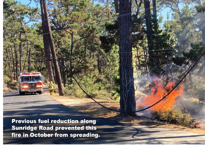
Previous fuel reduction along Sunridge Road prevented this fire in October from spreading.

"There was a significant wind that day, and we could have lost three or four acres if the area hadn't been cleared," said Chief Silveira. "Fuel reduction is an ongoing effort. We will continue to treat new areas, and maintain places that we have already treated."